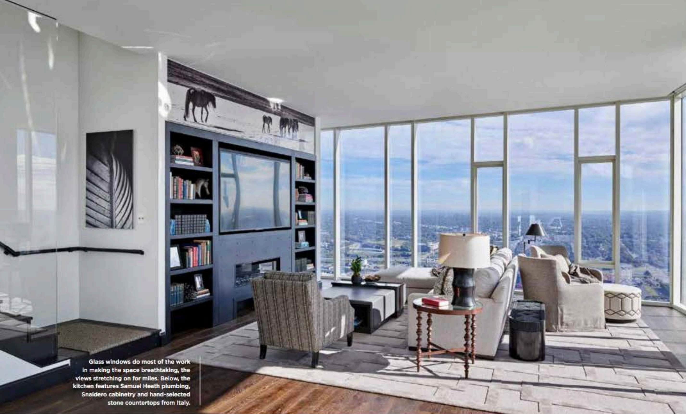
Glass windows do most of the work in making the space breathtaking, the views stretching on for miles. Below, the kitchen features Samuel Heath plumbing, Snaidero cabinetry and hand-selected stone countertops from Italy.