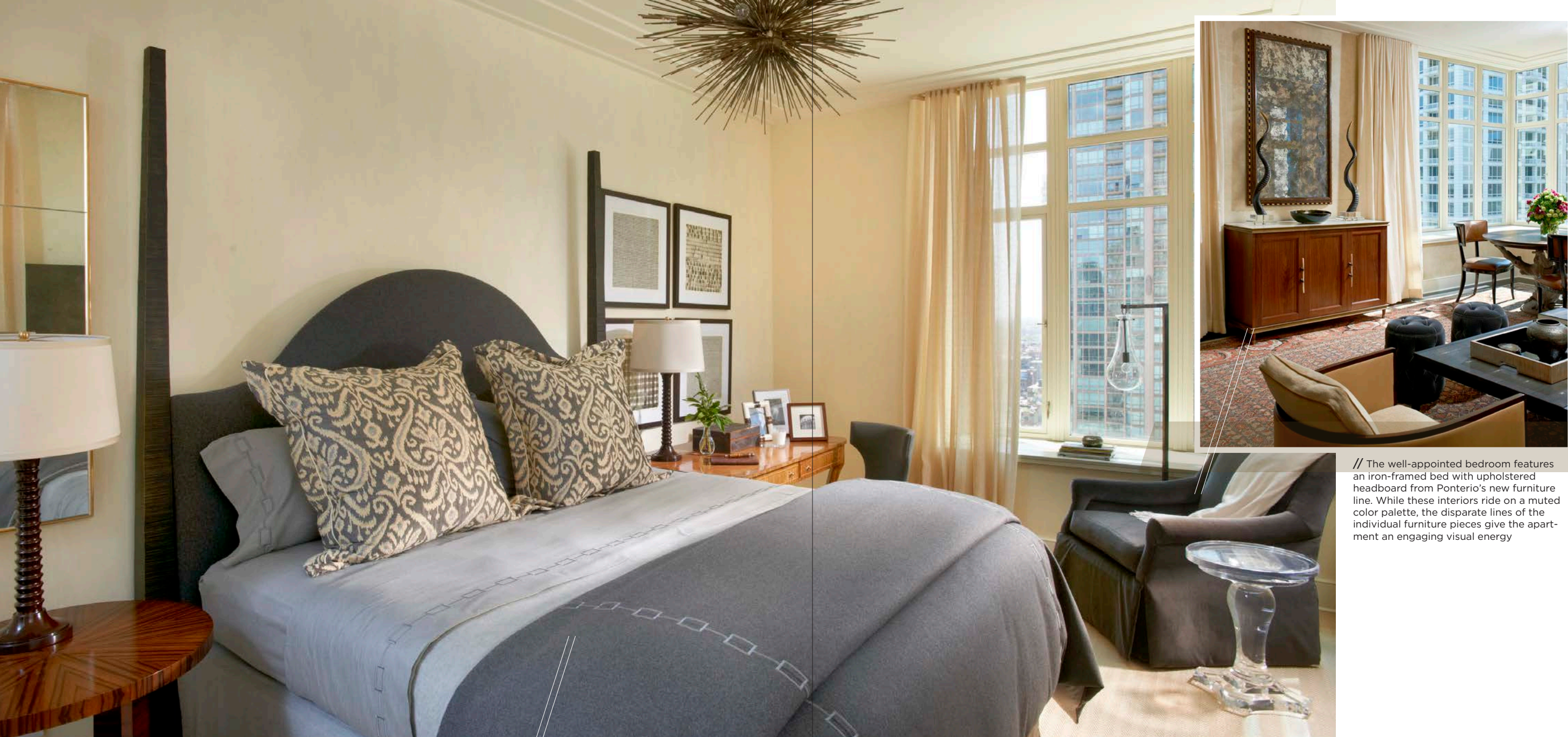
// The well-appointed bedroom features an iron-framed bed with upholstered headboard from Ponterio's new furniture line. While these interiors ride on a muted color palette, the disparate lines of the individual furniture pieces give the apartment an engaging visual energy

Who doesn't like a nice hotel? You don't have to make the bed, and dinner appears almost magically, on a tray. But for all its comforts, hotel life can get tiring. No matter how nice the accommodations, even a suite at a five-star property still isn't home. And for those whose business or social life takes them into town on a regular basis, nothing beats a pied-à-terre .