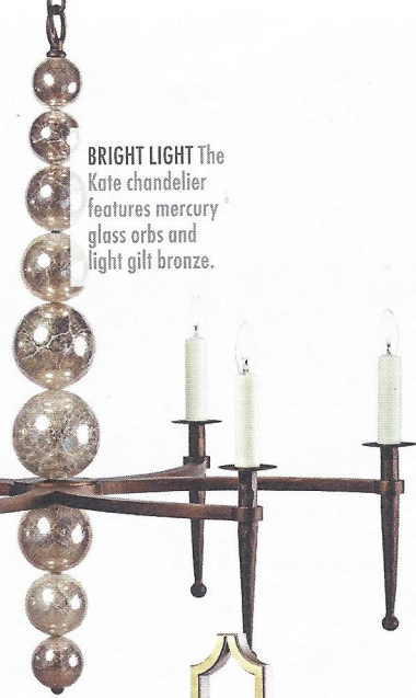
BRIGHT LIGHT The Kate chandelier features mercury glass orbs and light gilt bronze.