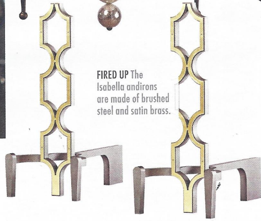
FIRED UP The Isabella andirons are made of brushed steel and satin brass.